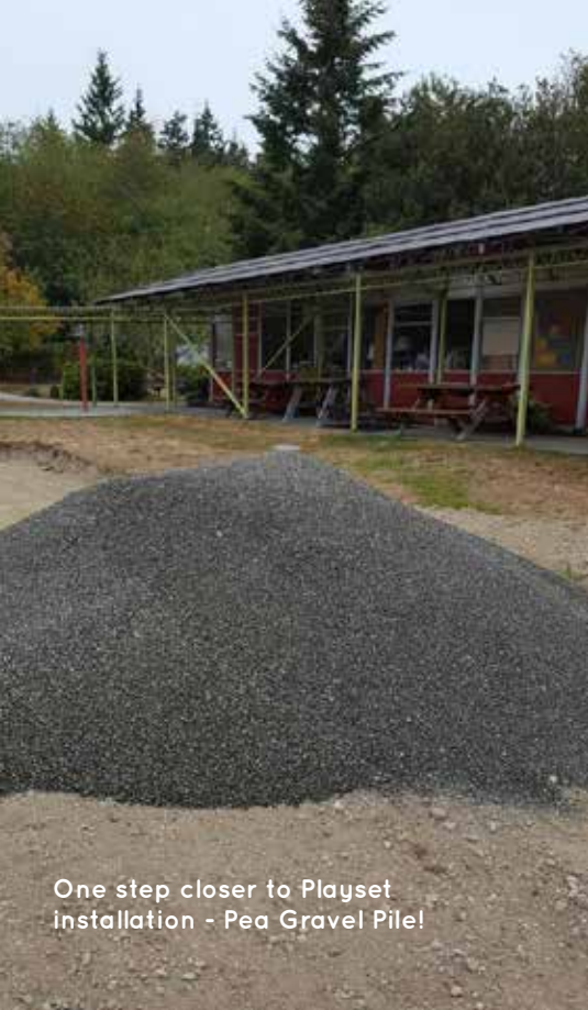
One step closer to Playset Installation - Pea Gravel Pile!