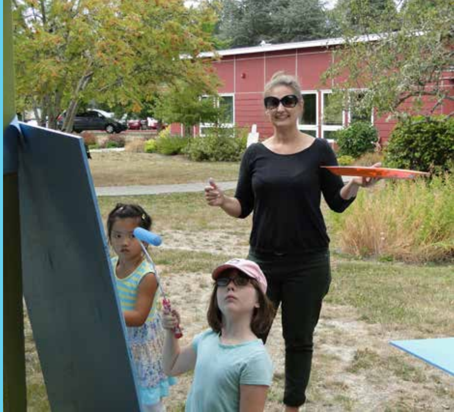
Campus Work Party painting team!