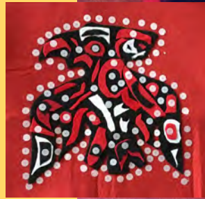
Photos: Anya's large blanket (circa 1997) and the smaller photo is one done at Carpe Diem this year!