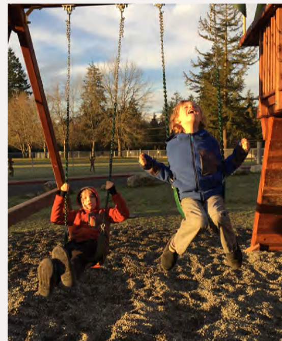
Feels like Spring is here!